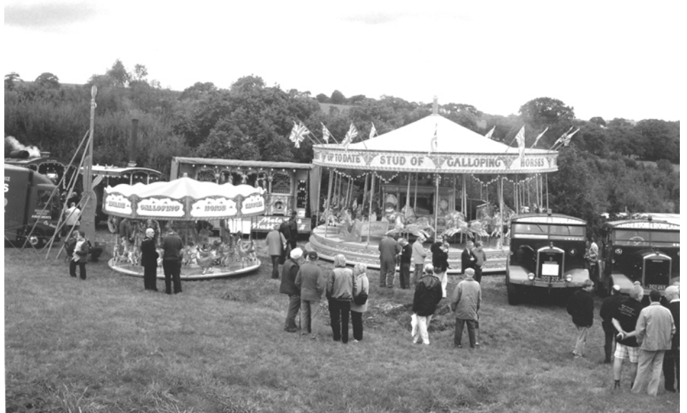
Outside exhibits at the Fairground Weekend at Dingles in September, 2005.