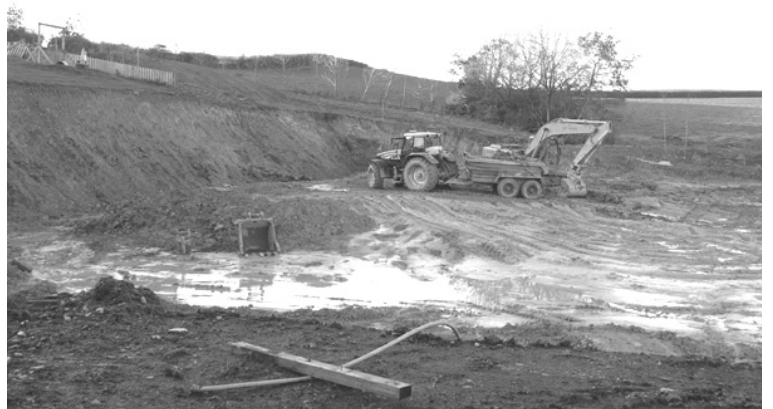
The current scene at Dingles Steam Village, showing the work in progress on the site (09/11/05).

It has been suggested that in order to focus your minds on the Trust's need for financial assistance, it may prove helpful to itemise some of the specific needs.